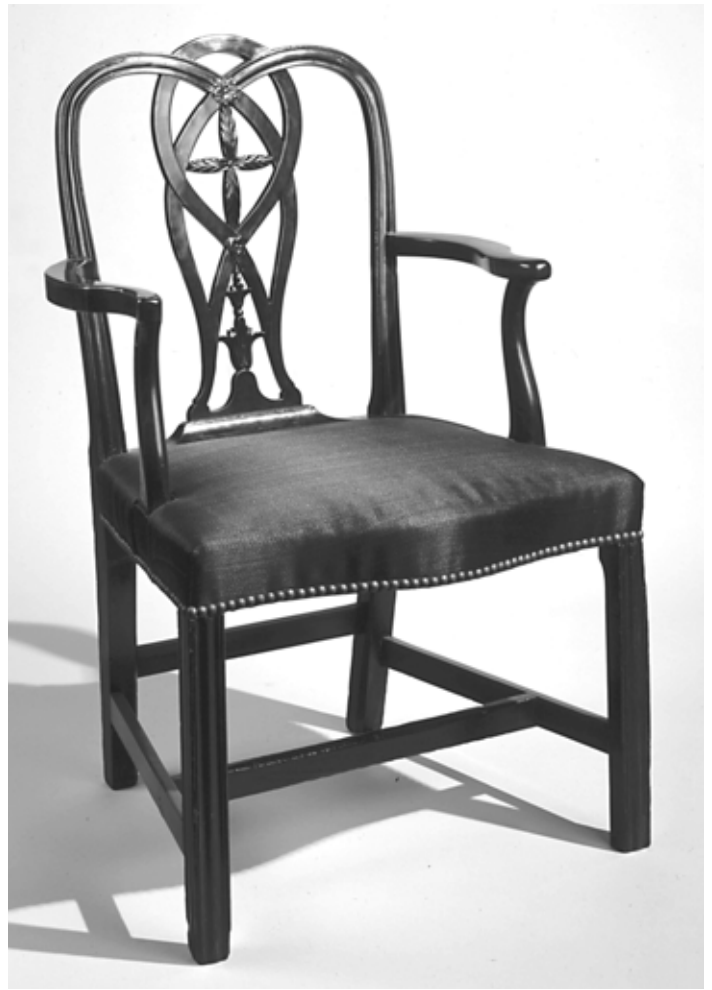
On display from The New-York Historical Society, the armchair used by George Washington, Ulysses S. Grant, and James A. Garfield at their presidential inaugurations.

To purchase tickets for the Opening Night Party or for Young Collectors' Night, call (718) 292-7392 or visit the show's website, www.winterantiquesshow.com . General admission: $20, which includes coat check and the award-winning Winter Antiques Show catalog.