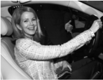
Blaine Trump tests out the latest Ferrari model