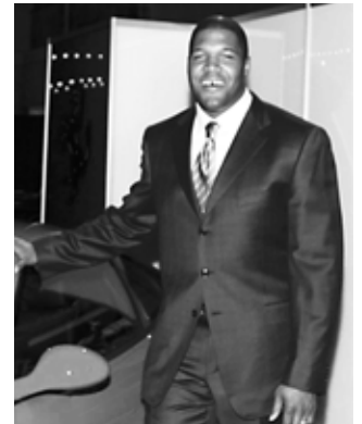
New York Giants defensive end Michael Strahan