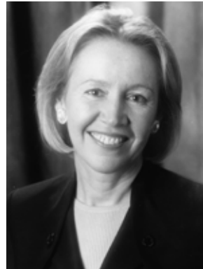
Mrs. George E. Pataki