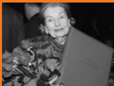
Elinor Gordon Scholarship Fund, 4