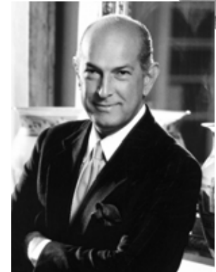
Oscar de la Renta