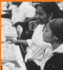
New Mobile Computer Lab, 6