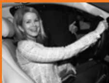
Gala Preview of the 2004 New York International Auto Show, 3