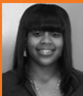
A College Dream Realized, 5