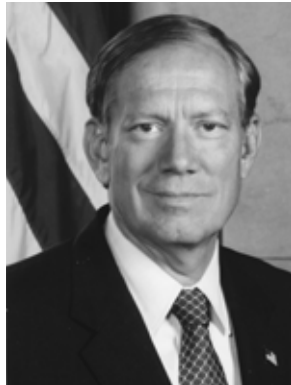
Governor George E. Pataki